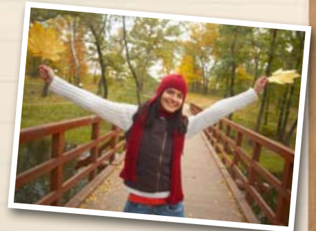
Full of life