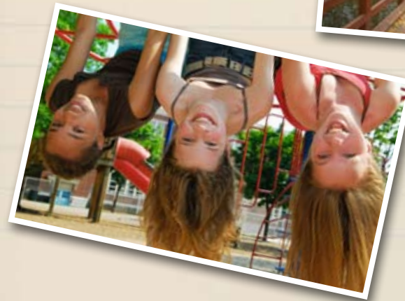
Active and having fun